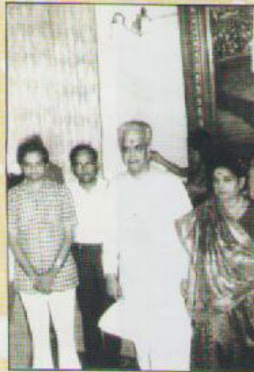
1976 - AIREA Office bearers with Governor Mohanlal Sukaria