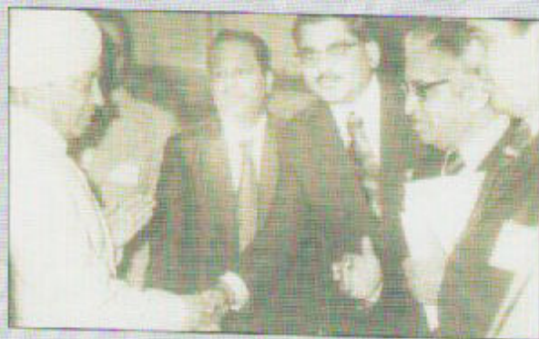
1975- New Delhi- Vice President of India Hon'ble RD Jetti & AREA office bearers.

Apart from these major achievements at the central government level, every zone had successfully addressed many issues pertaining to their state and has achieved conducive results and amendments in the laws.