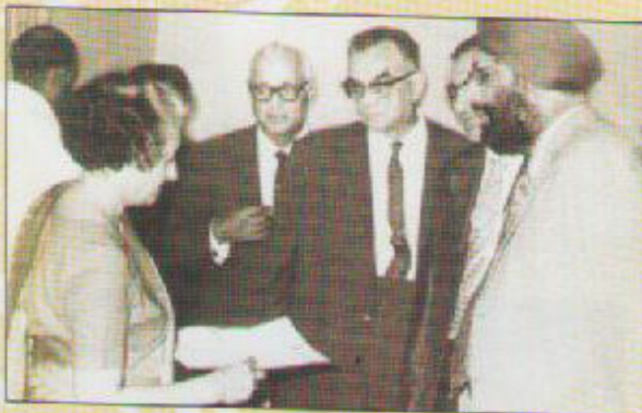
1972 - Bombay - Central Committee Members with Prime Minister Indira Gandhi - with Mr. Batti, L.J.Chandra, Fazalboy & T.P. Sheth, inviting for convention & Exhibition