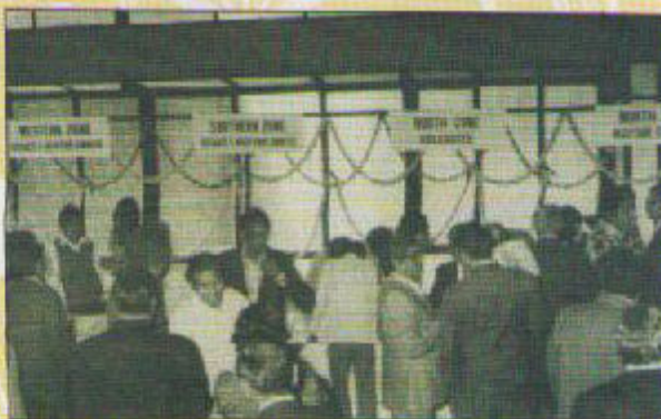
1978 - All India Radio & Convention at New Delhi.