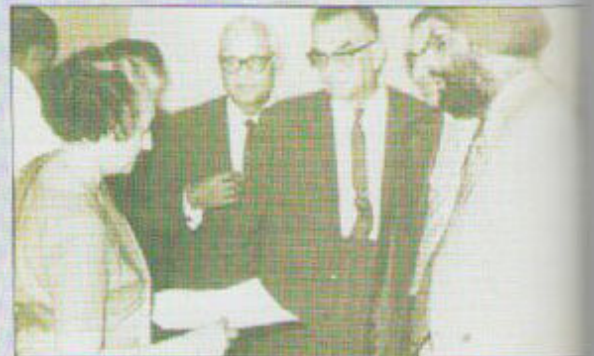
Hon'ble Prime Minister Mrs. Indira Gandhi meets AREA Delegates.