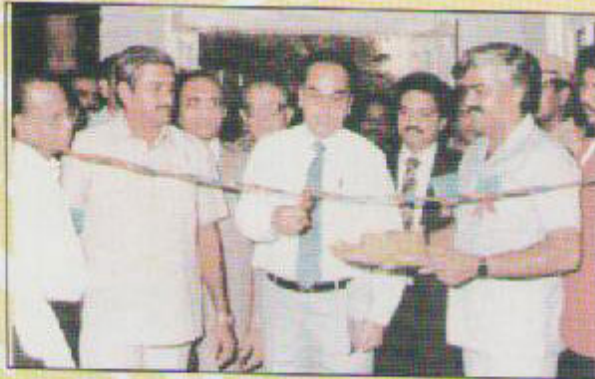
1988 – Exhibition Inauguration at Chennai.