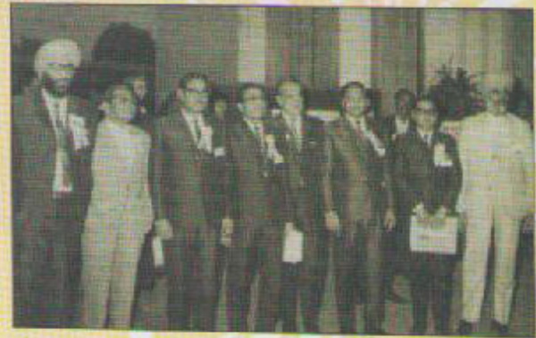
Central Committee Members at Delhi