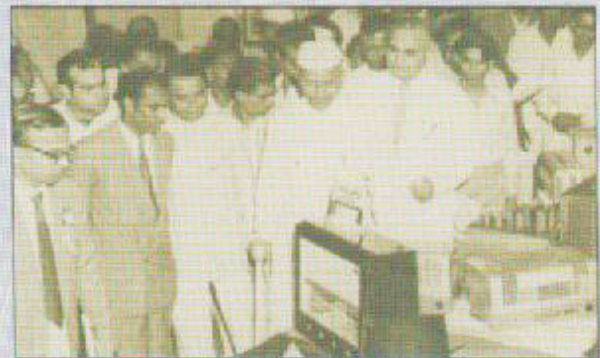
Deputy Prime Minister Hon'ble Sri Morarji Devasai inaugurating Electronics Exhibition.

With all India status, the Association was recognized both at the Centre and State levels. With dedicated group of members in all zones, the Association represented the problems of Trade and Industry to the concerned authorities for their redressal. It has met with great success in suggesting policy decision by the Government for development of Electronics. The foresight and efforts of all veterans of Association, deserves tremendous praise. They have been instrumental in growth of Electronics Trade and Industry in the country.