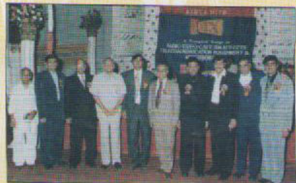
AREA Night – Committee Members of West Zone.