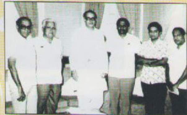
1979- AIREA South Zone Office bearers with Honourable I & B Minister - L.K. Advani