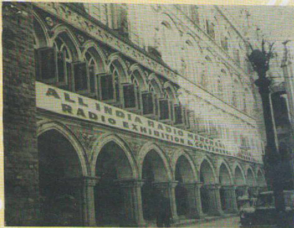
1954- Exhibition organized by AREA at Taj Hotel, Mumbai.